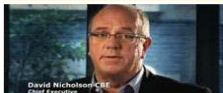
David Nicholson CBE Chief Executive

Find out what NHS Chief Executive David Nicholson thinks about Good Corporate Citizenship - view his message of support